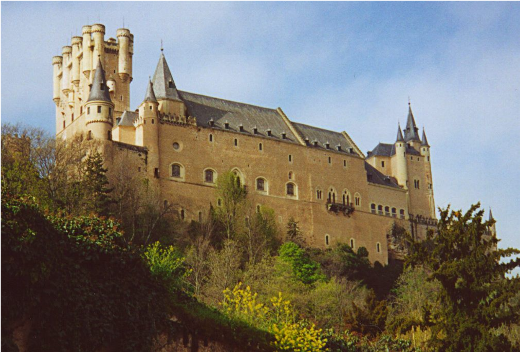
The Segovia castle, Spain. Military archive is in the basement