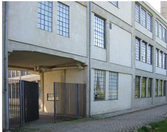
Figure 1: The test room window is to the right of the archway. It faces west.

The room is made of concrete, plastered and painted. It has two outer walls with a west facing window (fig. 1). The volume is 26 \text{ m}^3 and the surface area of wall is 56 \text{ m}^2 . 7.5 \text{ m}^2 of the internal corner of this wall is covered with unfired brick, 110 mm thick. 2.5 \text{ m}^2 of this buffer area is perforated to give a larger active surface area, the rest is unperforated and covered with a variety of porous finishes, such as lime wash (fig. 2). The measured air exchange rate is 0.125 per hour. The data logger is mounted in the centre of the room. There is no heating within the room but heat leaks in from the building to give a winter temperature which seldom falls below 10 \text{ }^\circ\text{C} . There is direct afternoon sunshine on the window, which is screened on the inside by a translucent curtain. The room is empty.