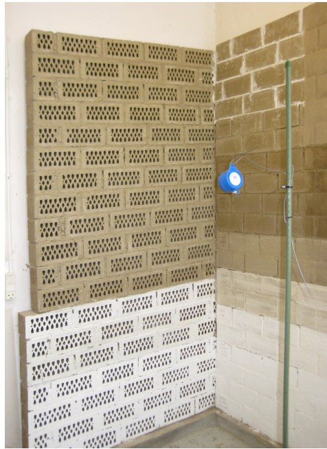
Figure 2: The inside corner of the room showing the perforated unfired brick and some areas with various experimental finishes, to reduce dusting.