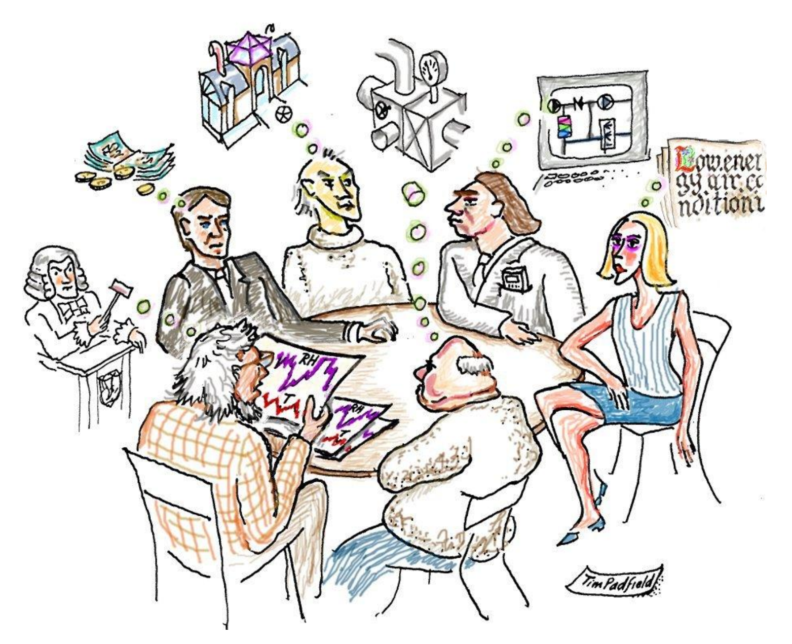
The first meeting in the design group