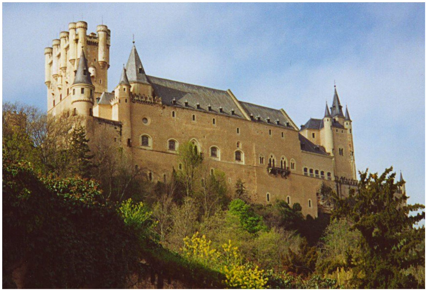
The Segovia castle, Spain. Military archive is in the basement