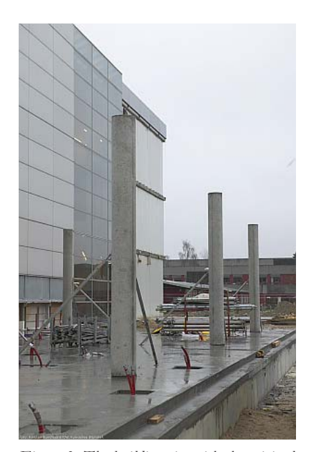
Figure 3. The building site with the original façade of block 1 and the additional constructions to support the new façade.

10% of the total amount of ventilated air. This system has shown several weaknesses. If the internal humidity or the temperature in the storage becomes too high, it is difficult to return to the set points, because there is no cooling capacity or dehumidifying equipment for the recycled air. Furthermore, the recycled air does not pass the carbon filtration unit, and thus internally generated gasses are not absorbed. While designing the new storages (block 2), it was clear, that the concept for climate control used in block 1 could not match either the old or the new requirements for the climate in the storages.