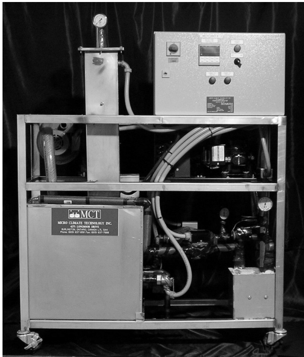
Figure 4. An early constant volume generator for positive pressure delivery, 1994

to effectively flush pollutants from within the cases. More than twenty units were built in the 1980's from the CCI design by Kennedy-Trimnell Inc., and used successfully in a number of North American applications [19]. The buffered moderating system was used again in an improved design published by CCI over a decade later.