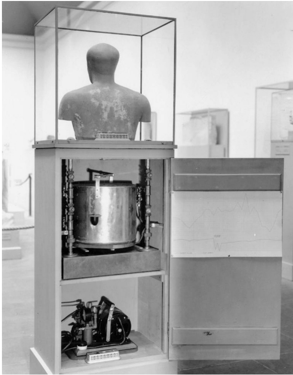
Figure 2. Electrically assisted passive humidity controlled display case, 1938

used as a passive buffer, humidity control could now be effectively provided in a sealed display case with a much larger volume than a picture frame.