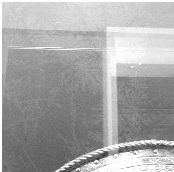
Figure 3. Trapped pollutants create pattern on glass

Early on, conservators sometimes noted unusual odours in their cases, especially as the cases became more effectively sealed. Tests revealed that pollutants generated within the enclosure could sometimes be at least as dangerous as those coming in from the outside. The expansion of analytical techniques in the late twentieth century revealed even more families of deleterious chemicals and measured these chemicals in smaller concentrations. A well-sealed case will not