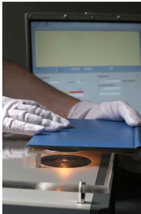
Figure 2. The SurveNIR instrument for non-destructive evaluation of paper chemical and mechanical properties based on chemometric evaluation of NIR spectra.

The authors gratefully acknowledge the support of the European Community, 6th Framework Energy, Environment and Sustainable Development programme, contract no. SSPI-006594 (SurveNIR). The work is the sole responsibility of authors and does not represent the opinion of the Community.