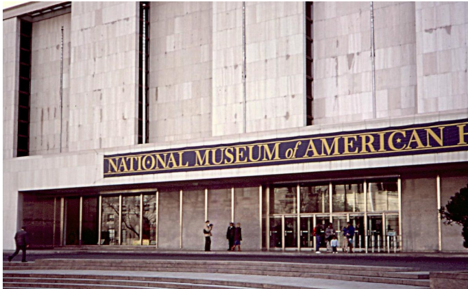
Figure 1.6 The National Museum of American History, in Washington D.C. On a bright spring morning the marble facade is stained by meltwater from ice that has condensed from the inside air.

20°C. Nevertheless, museums in old buildings, typically of massive brick construction, seem to survive whereas some purpose built museums with complicated precautions