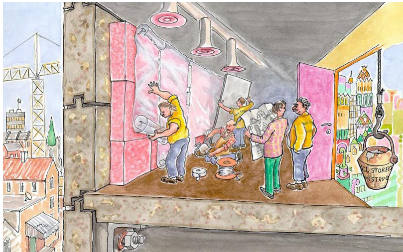
Figure 1.5 In modern buildings an impermeable barrier is often placed just behind the interior finish.

Condensation damage is, however, not unknown in modern buildings with vapour barriers and more or less non-absorbent materials in the walls (10). The reason for this is that any hole in the barrier will allow air to flow into parts of the wall which have no ability to delay condensation by absorbing water vapour. After condensation has