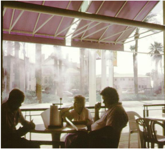
Figure 1.1 A cafe scene in Phoenix, Arizona. The air is cooled by evaporation of water sprayed from the edge of the canopy. The air becomes more humid but the customers are more concerned with keeping cool.

This thesis is about controlling the relative humidity inside buildings by using the water absorption properties of porous materials.