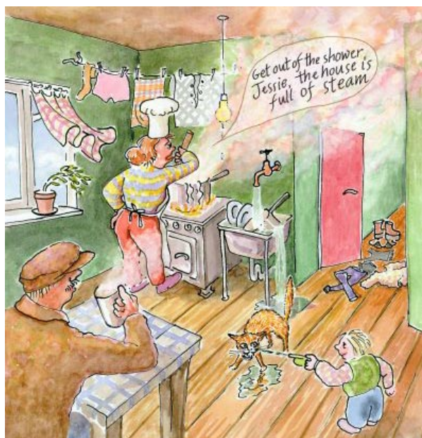
Figure 1.4 Humans, from the point of view of building physics, are merely sources of water.

Humidity control in storerooms is a little more complicated than in showcases or packages because the ventilation rate is enough to stress the ability of absorbent materials to absorb and release water vapour fast enough to compensate for the air change. The ventilation rate in store rooms can be low, because there are no people permanently resident in the room, but it is desirable to maintain a slight over-pressure within the room to stop dust and pollutants from entering. The possibilities for low energy control are summarised in chapter 6.